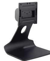
Desktop Stand P/N: ACC-008-44